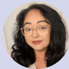
Kennedy Hauder Crawford & Associates Administration